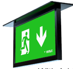
With Additional Recessing Kit